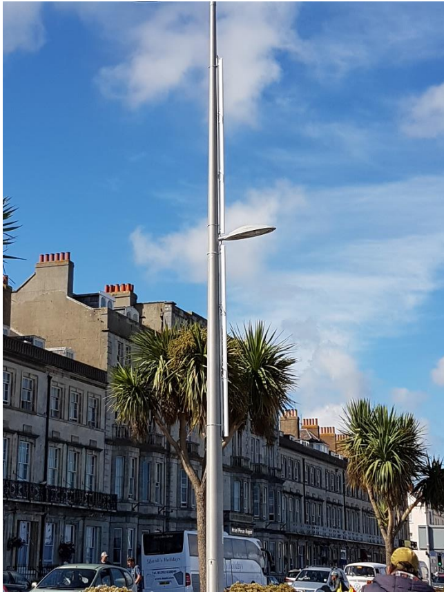
Figure 2. Temporary installation of the 5.6 metre example lighting looking north east in day time.