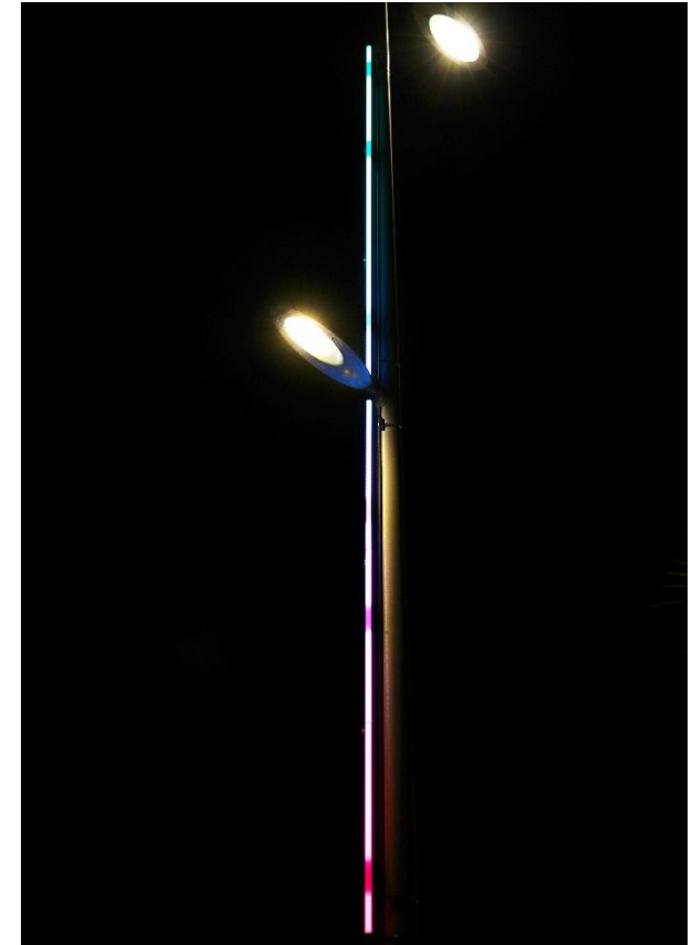
Figure 4. Temporary installation of the 5.6 metre example lighting at night showing the impact of the installation, lifting away from the column