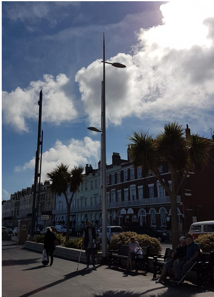
Figure 1. Temporary installation of the 5.6 metre example lighting on a Sapa column, looking south west in day time