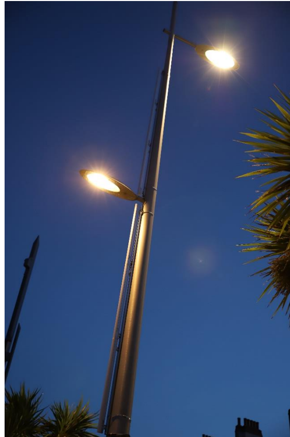
Figure 3. Temporary installation of the 5.6 metre example lighting at dusk.