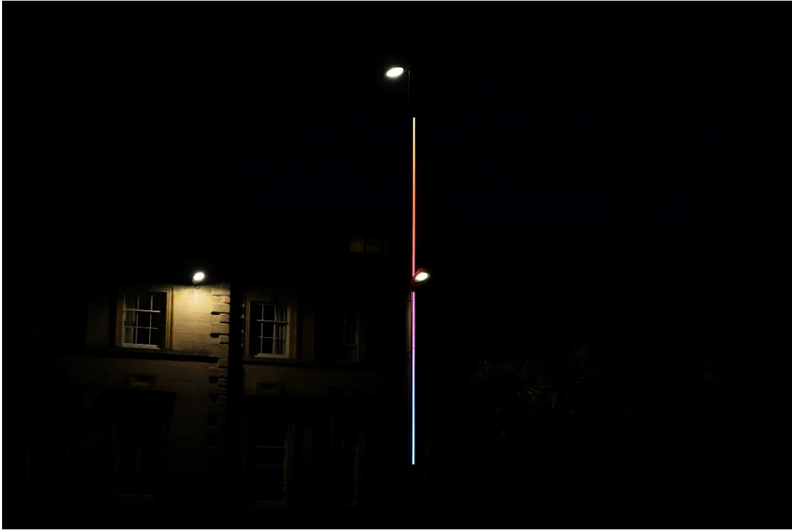
Figure 5. Temporary installation of the 5.6 metre example lighting at night showing the subtle and striking simplicity of the design and the range of colours that are achievable