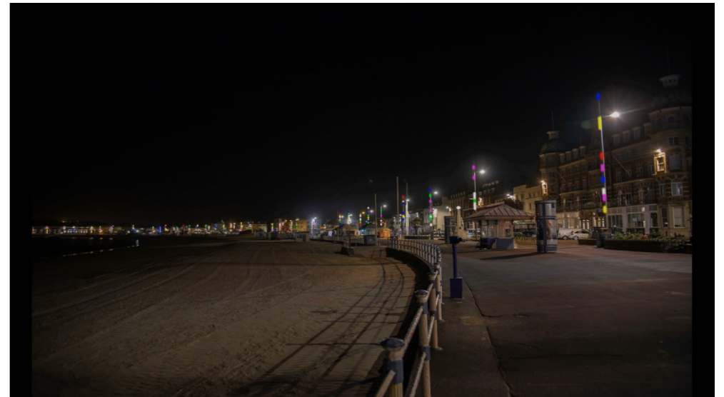
Joyful Colour Range